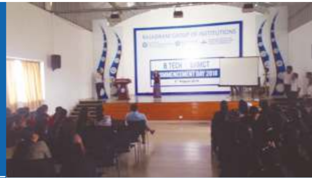
Students Showcasing their Talents

It was all about making the best start to the new academic year, a time to create everlasting