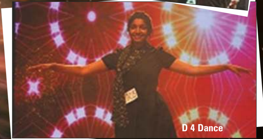
D 4 Dance