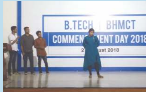
Students Presenting a Group Event

relationships with each other. The event was an indication of union among students.