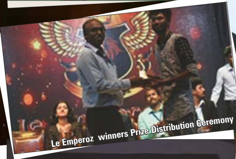
Le Emperoz winners Prize Distribution Ceremony