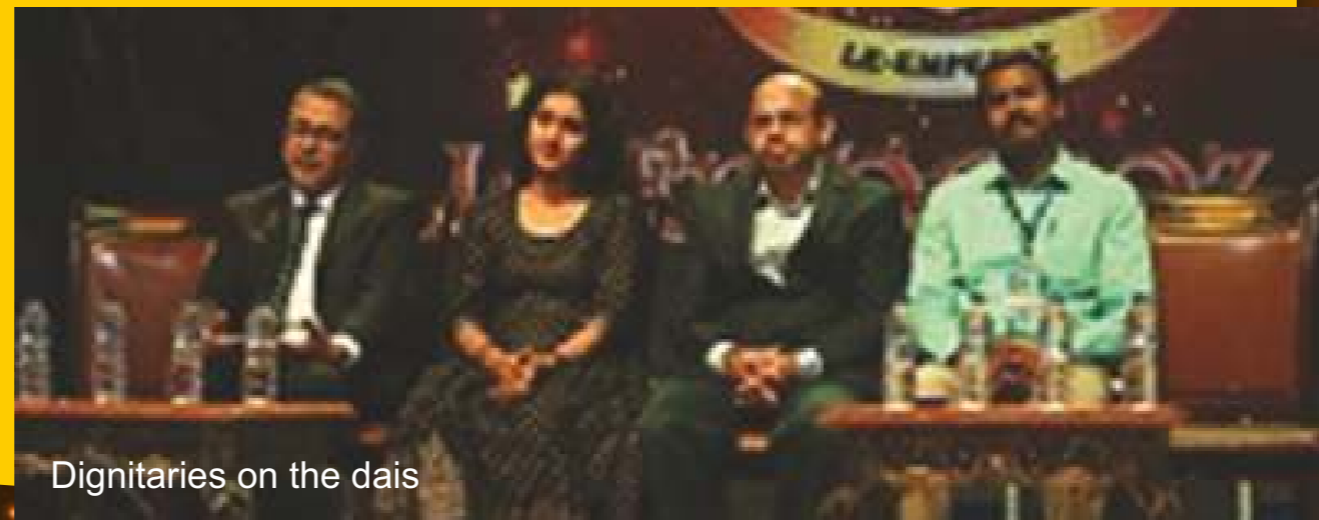
Dignitaries on the dais