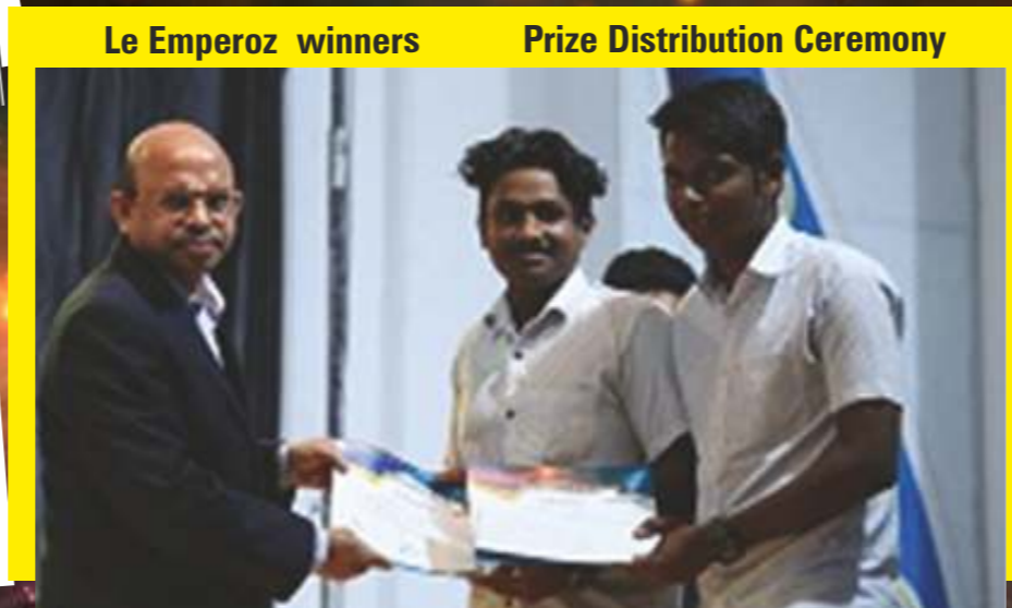
Le Emperoz winners Prize Distribution Ceremony