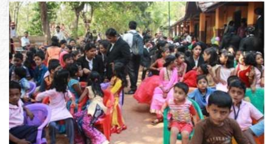
RBSites Share a Light Moment with the Tiny tots of Mevarakkal School.

"Christmas is doing a little something extra for someone." Rajadhani Business School celebrated Christmas and New Year with the students of Mevarakkal Government LP School Nedumparambu on 22 December 2018. This was an initiative of Rajadhani Business School's Community Reach Programme. This event was conducted in association with Parent Teachers Association (PTA) of the School. Faculty members and students visited the school with gifts and chocolate packets and distributed it