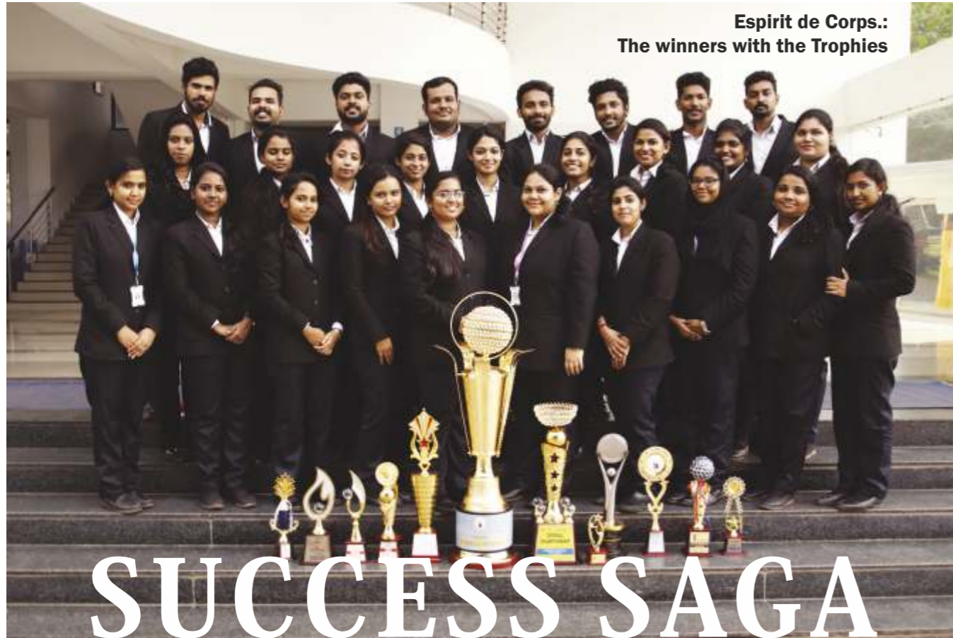
Espirit de Corps.: The winners with the Trophies